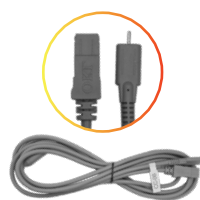
AHD-006 Flat Head, Dual Pole