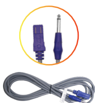
AHD-003 Microphone Head, Single Pole

For the full compatibility chart scan here