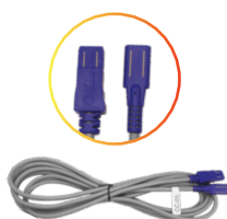
AHD-005 Flat Head, Single Pole